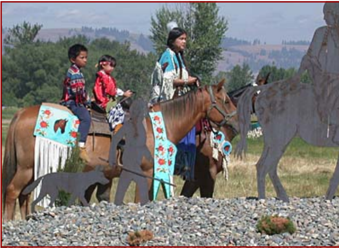
Nez Perce who took part in the Dedication.