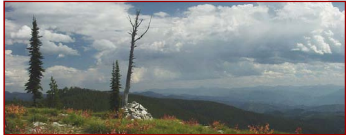
Indian Post Office along the Lolo Trail.

December - Seasons Greetings from Foundation to members sent via regular mail and email.