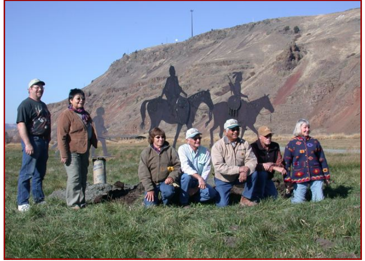
Representatives from the Nez Perce Trail Foundation.