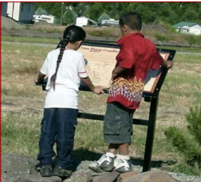
Nez Perce children reading sign.