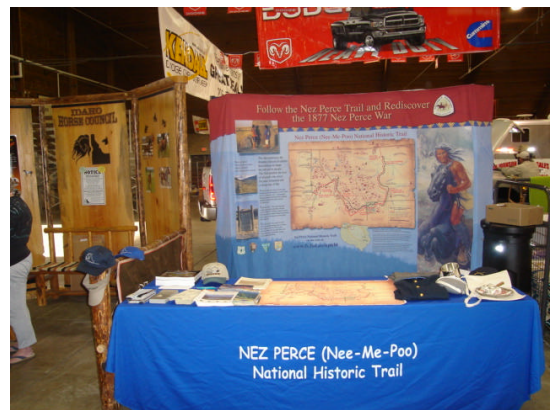
Our Booth at the Idaho State Backcountry Horse Men Annual Convention